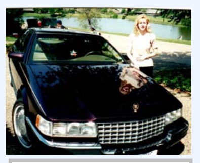
Pre-loved 1992 Seville M/T #1