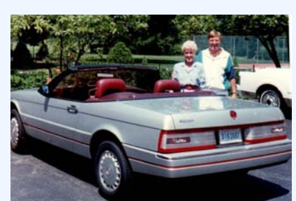
First new 1987 Allante`