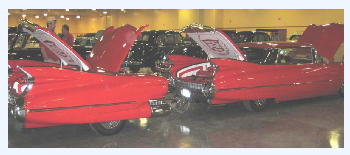
1959 Cadillac and Trailer Las Vegas Show 2009 (Ruby Musser)