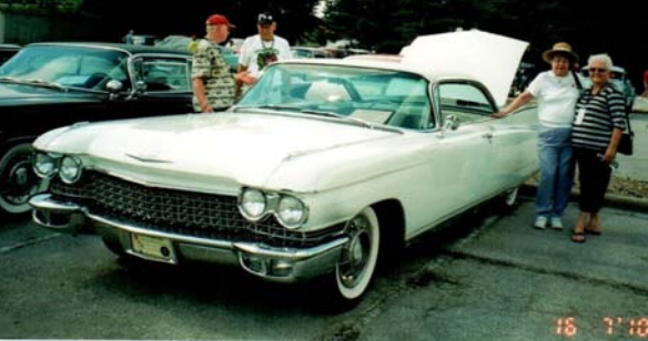
1960 Eldorado Seville "What Lola wants, Lola gets"