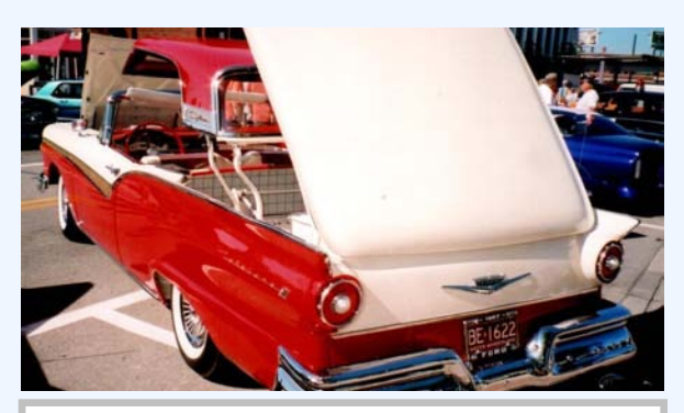
World renown 1957 Ford retractable hard top