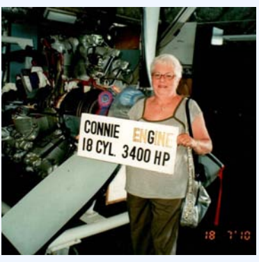
TWA "Connie" flight engineer station