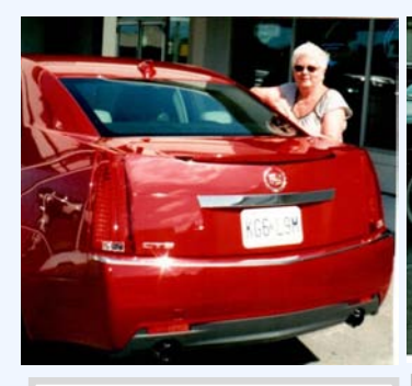
New 2015 Cadillac