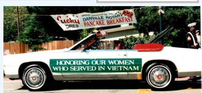
As member of Vietnam Veterans Diablo CA, we drove the Eldorado