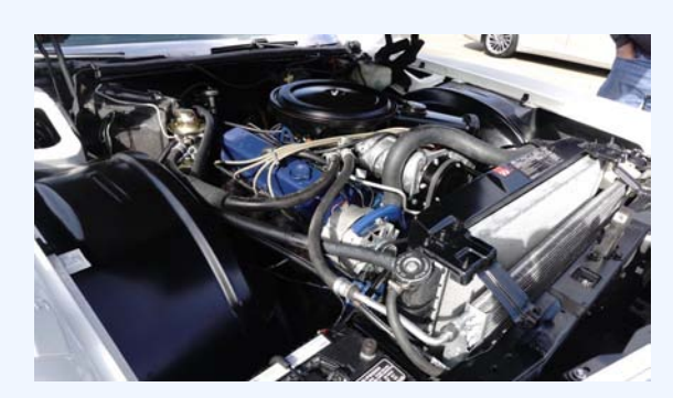
Jeff's highly detailed 500 cu in (8.2-liter) V8 engine, 190 horsepower and 360-pound feet of torque. 0-60 mph in 12.9 seconds, 0-100 mph in 42.9 seconds with a top speed of 115 mph.

Like most projects, there's always more to do, and this car is no exception. Jeff says "this car is a driver, so I drive it. It will never be a perfect show car, but it looks decent and it's a lot of fun, so I'll work on it, and drive it some more and work on it again, until, well, who knows when?"