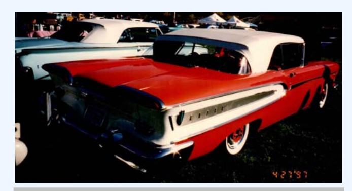
1958 Edsel handsome design Note: back window N.Z.