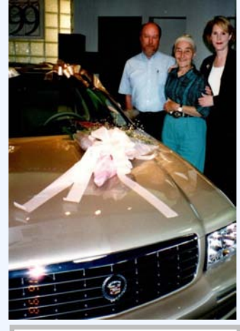
My 91 yr owner new Sedan