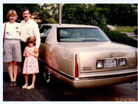
New 1996 enduring luxury appeal