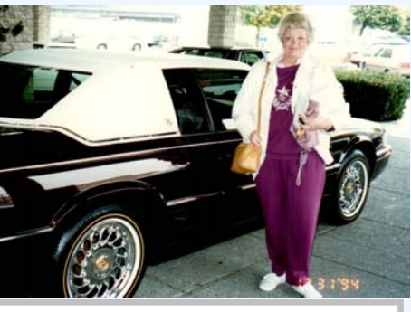
My owner—new 1994 Eldorado