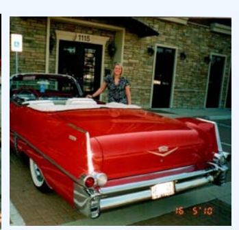
My 1957 Cadillac