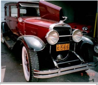
Goddess 1928 Cadillac