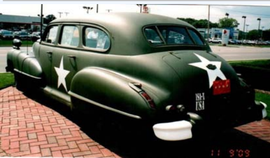
1942 Cadillac "Ike" staff car fully equipped Series 75, built by Fleetwood. In addition to the standard factory equipment that included a flathead V8, it has blackout shields for all of the lights, a siren and flag mounts. Everything on the outside is painted olive drab, including all of the chrome trim, hub caps, badging and hood ornament. It may be painted olive drab but the Cadillac crest and name is all over the car, every logo is intact.