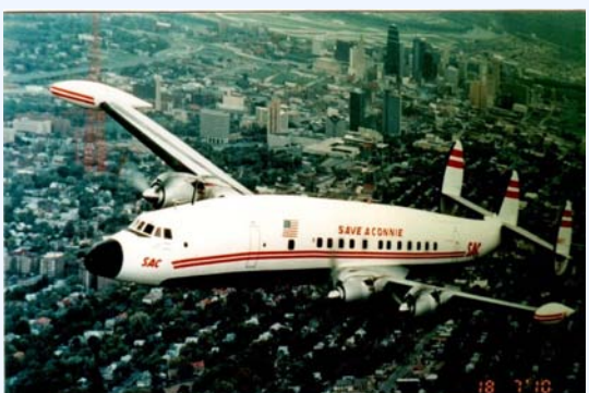
TWA's Super "G" Constellation Skyliner. Toured the TWA Museum in K.C. 347 mph Constellation. 2010 She flies over K.C. NFL games! The USAF would fly me in a Navy