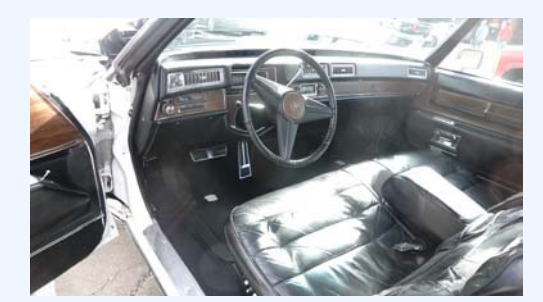
A comfortable and roomy interior of fine leather. Like driving from your living room.